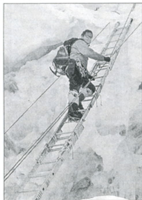
At the North Col, at 7,000 metres.

REACHING the summit of Mount Everest, the highest peak in the world, would be enough for most people brave enough to attempt such a dangerous, arduous climb.